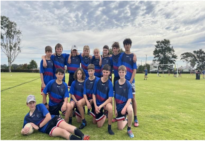
Year 8 Boys Oztag Team