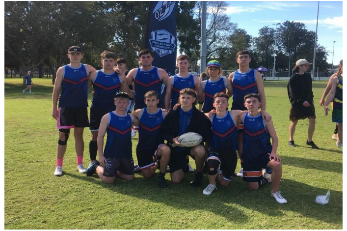
Year 10 Boys Oztag Team