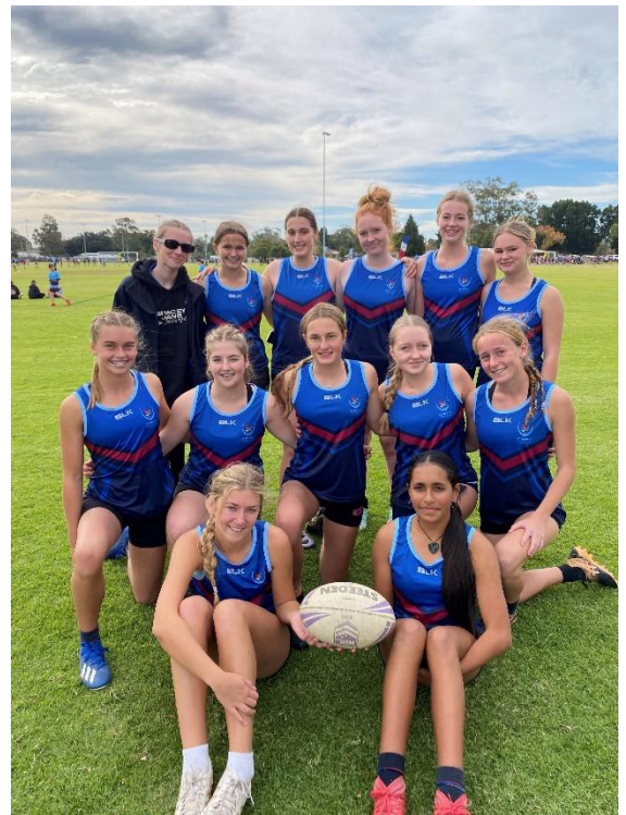
Year 10 Girls Oztag Team