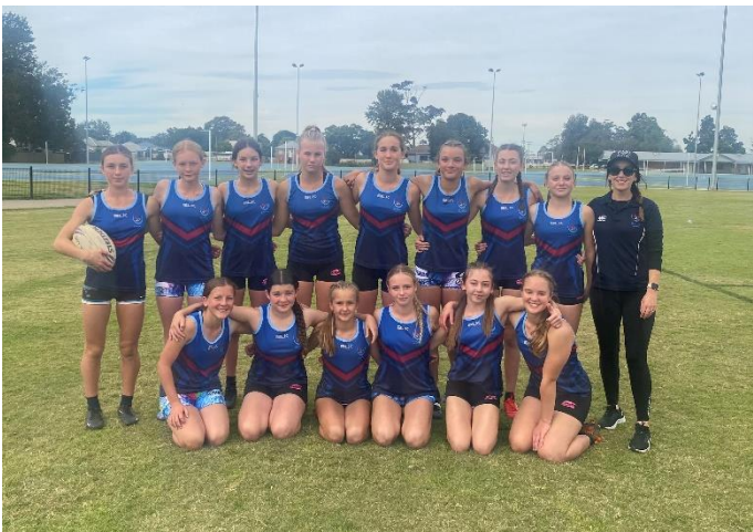
Year 8 Girls Oztag Team